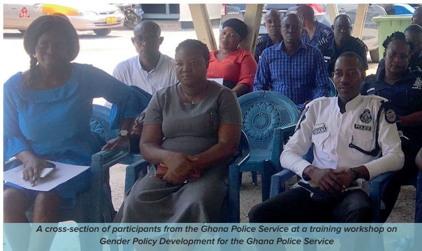
A cross-section of participants from the Ghana Police Service at a training workshop on Gender Policy Development for the Ghana Police Service

integrate gender perspective into its operations which will strengthen professionalism, enhance internal control mechanisms and improve its complaints management systems.