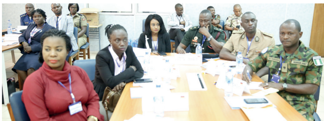
Participants in a Hostile Environment Awareness Training Course at KAIPTC

Given the reality that mission environments are typically unfriendly, especially considering the general living conditions, the weather, language, food, conflict, epidemic, just to mention a few, mission personnel need the requisite training to successfully work in such crises environments. They must be equipped with the right knowledge and skills to tackle future challenges and survive in such critical situations.